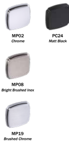
LIVA A 536