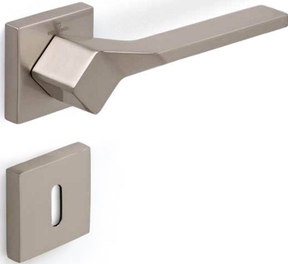
RIO A 548